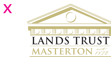
Incorrect, old Logo