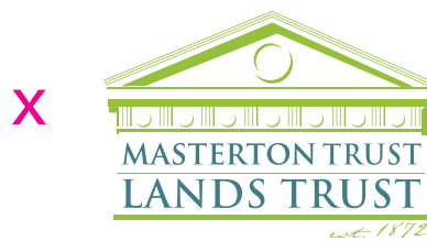
Incorrect use of colours