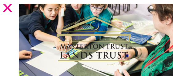
Obstructive Image background