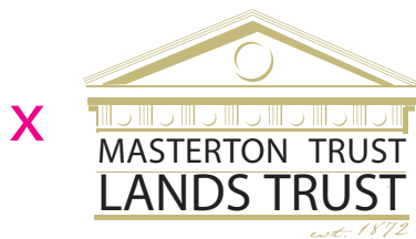
Incorrect Logo Type

The following examples illustrate some common mistakes made when using the logo. Please use master digital artwork from Masterton Trust Lands Trust to avoid mistakes and ensure consistent brand recognition and integrity.